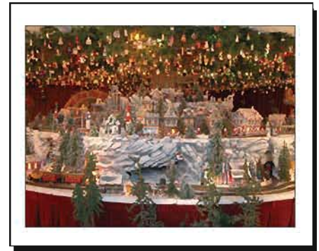
enjoy Toyland's magical train mountain