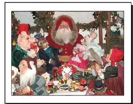
tour TudorTowne animated story book village