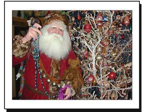
celebrate Christmas history and traditions

study aids are available by prior arrangement and may be used as an introduction to tours or as follow-up activities - see website for details